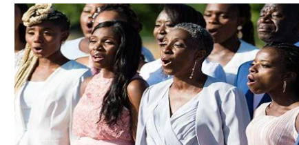
The Kingdom Choir