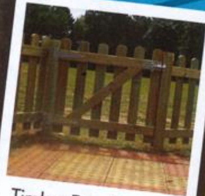
Timber Bow Top Gate